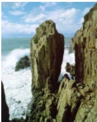
Rosoku Iwa (Candle Rock)